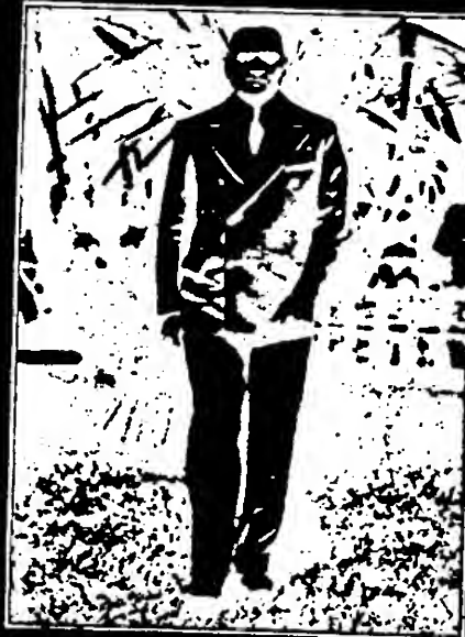
WASHINGTON'S EDGAR HOOVER For his "G-men," a new excuse.

the failure of his tough young men. In the days before they were equipped with sub-machine guns, automatics, tear gas bombs and fast automobiles, he was able to point out that they hadn't a chance against the enemies of society. Now they have these and other armaments and still do not meet with much success,